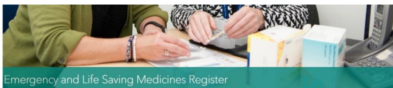
Emergency and Life Saving Medicines Register

VicTAG Victorian Emergency and Life Saving Medicines (ELSM) Register